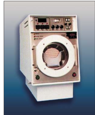
200 Series Benchtop