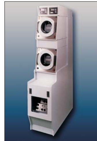
800 Series Stacker